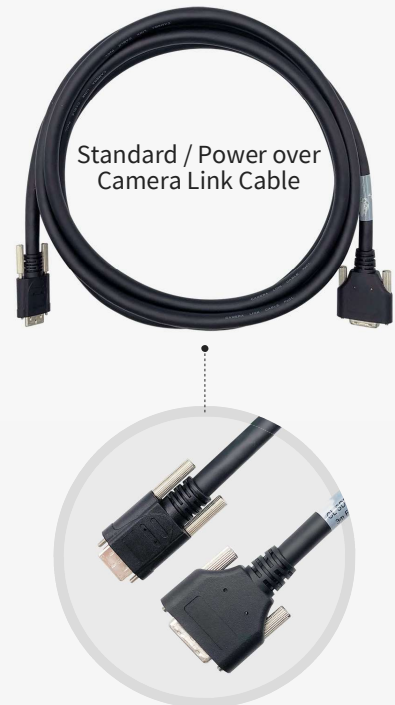
Standard / Power over Camera Link Cable